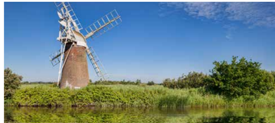
Images top to bottom: Hickling Broad & Turf Fen Windmill, Norfolk Broads

We spend the morning in Kings Lynn having a walking tour of its historic centre and visit Lynn Museum to see "Sea henge". After an independent lunch we make our way to Grimes Graves, an area of chalky grassland dimpled with over 430 prehistoric flint mine pits. Later we head to Bury St. Edmunds for the remainder of our tour.