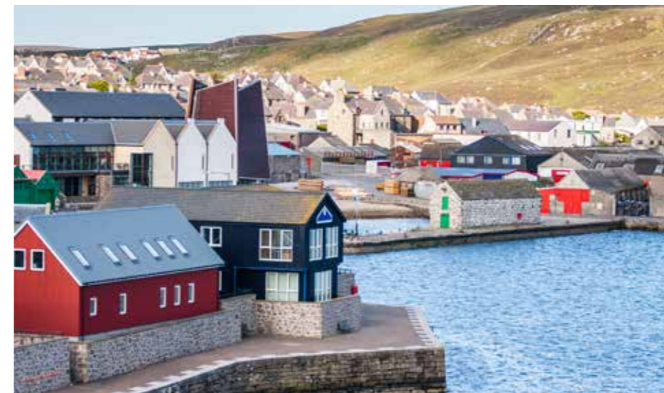
Images top to bottom: Iron Age house built upon a Bronze Age one at Jarlshof & Lerwick

Today we make our independent onward journeys.