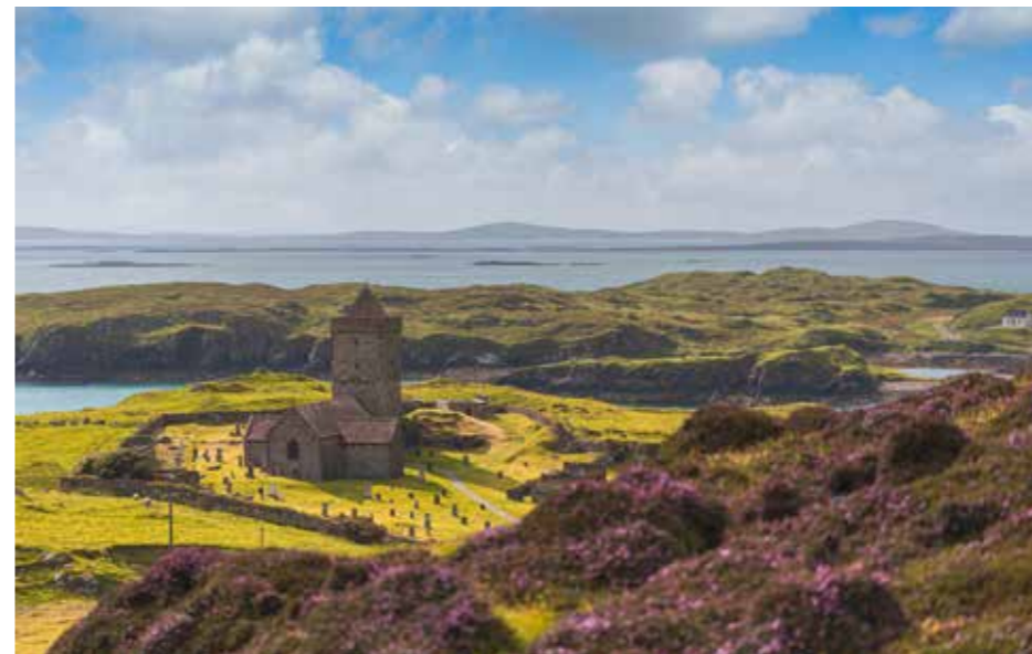
Images top to bottom: Lewis Castle in Stornoway & St Clements Church, Rodel

The day begins with an exploration of Carloway Broch , a remarkably well preserved 1st century AD fortification which was reused in the 17th century as a stronghold under the Morrisons of Ness. We continue to Clach an Trushal , an imposing 6 metre tall standing stone and then the mysterious site