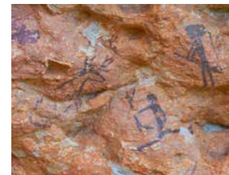
Images top to bottom: Sant Miquel Church in Olerdola & Abrics de l'Ermita Rock Art

This morning we drive to the coastal trading colony and tripartite site of Empuries , which was colonised by Iberian, Greek and Roman settlers. Remains at the site include the ruins of the Greek market and port, an ancient necropolis and the Roman-era walls, mosaics, amphitheatre and early Christian basilica. In the afternoon, we visit the Iron Age settlement of Ullastret , a fascinating early town, developed by the local Iberian tribe of the Indiketes and influenced by the Greek settlers on the coast.